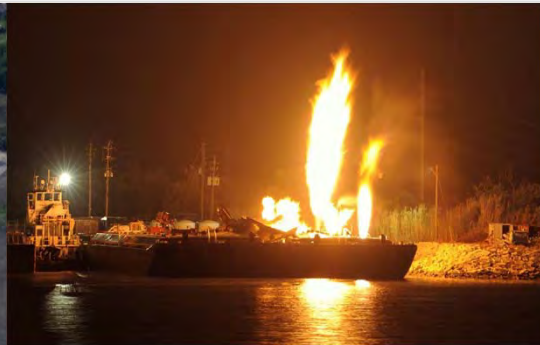
Mobile River Miss.