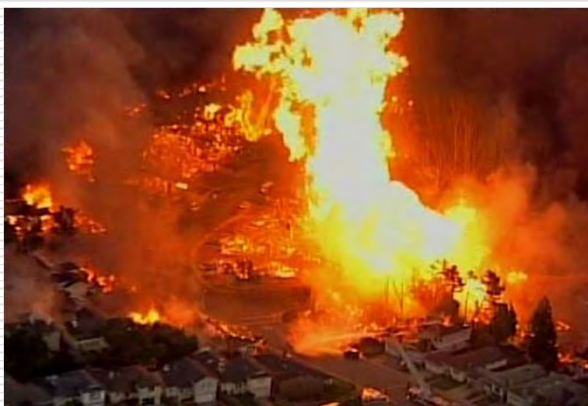
San Bruno, Calif.